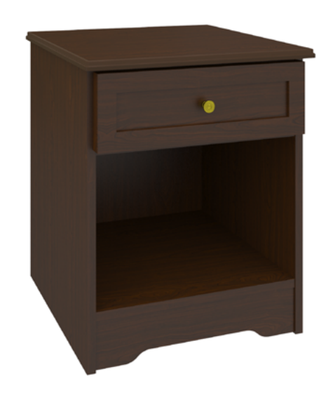
Model: MINS10 21W 19D 25H

Time-honored crafting and practical concerns blend to produce refined, functional furniture. OG edging and gently radiused corners add understated touches of distinction to these water- and scuff-resistant, fireretardant products. Choose from dozens of hardware styles, including ADA-compliant.